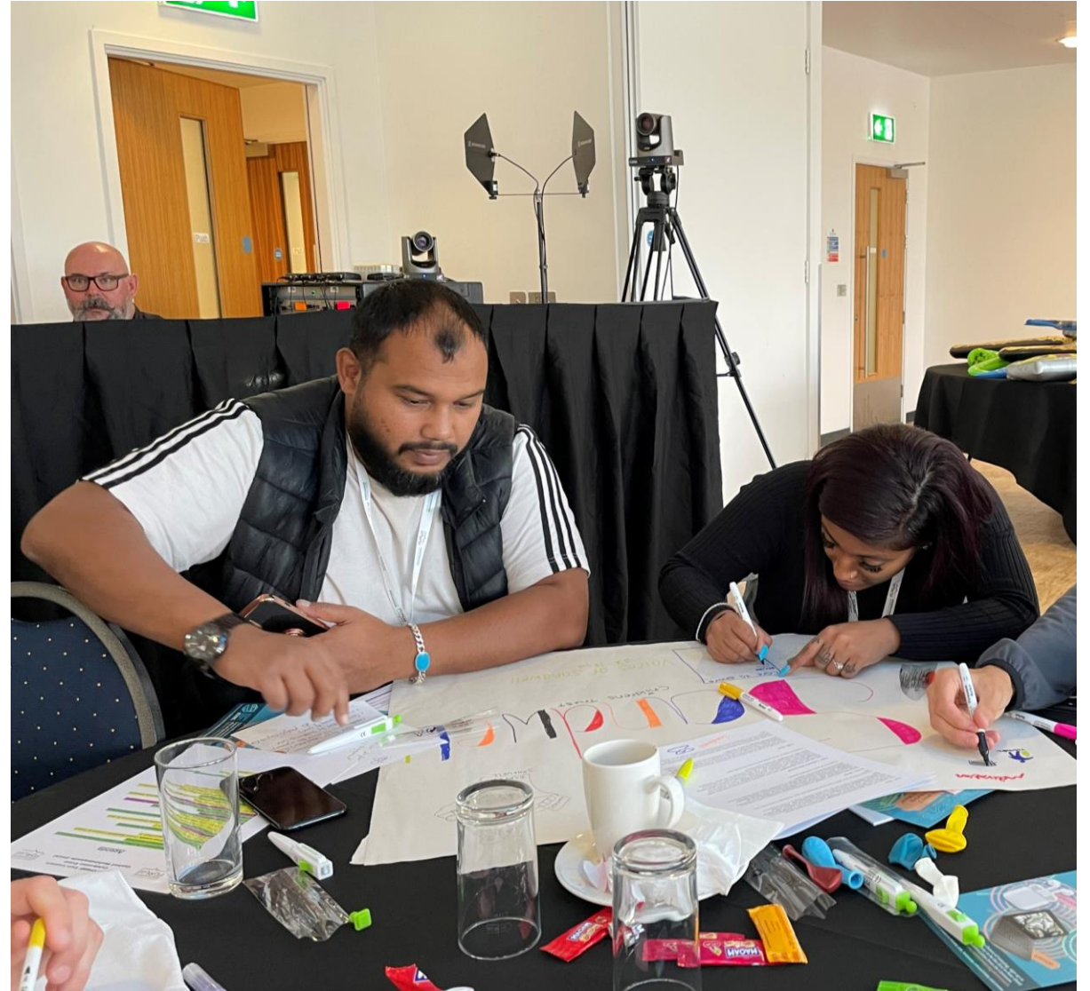
Celebration Event, Oct '21

YPBMF Events – North and South Event plus a central Celebration Event in Leaving Care Week