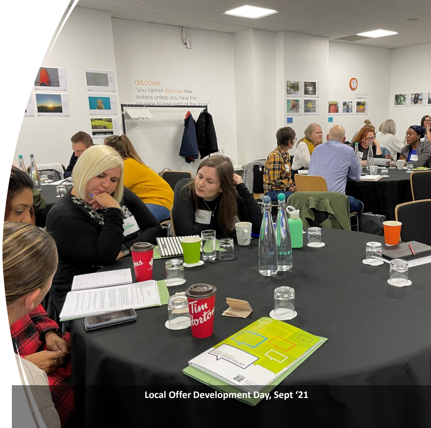
Local Offer Development Day, Sept '21

(Out of 152 local authorities in England)