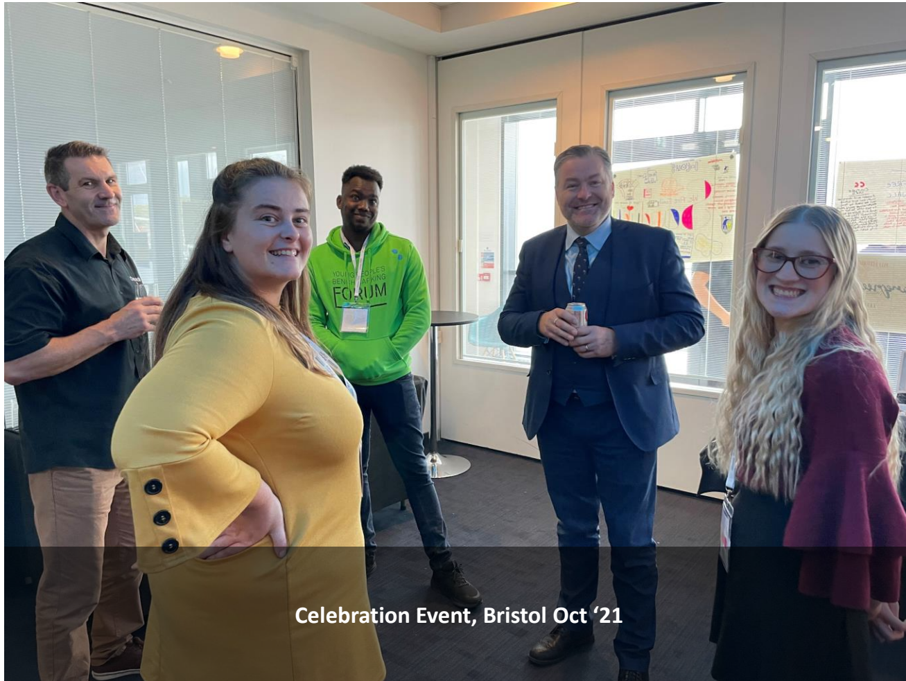
Celebration Event, Bristol Oct '21